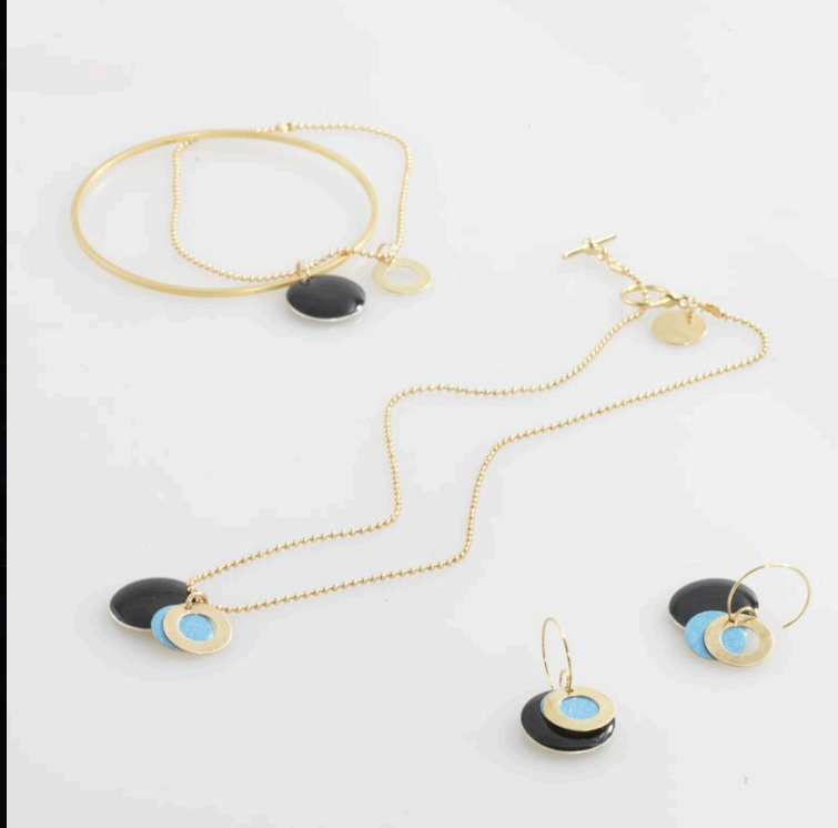
w102000 ceramics ● ● ● ● ● ● ● ● ● ●