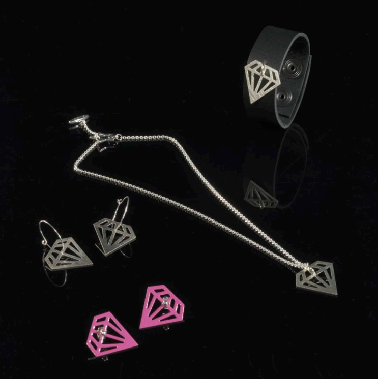
w101900 epoxy/metal ● ● ● ● ●